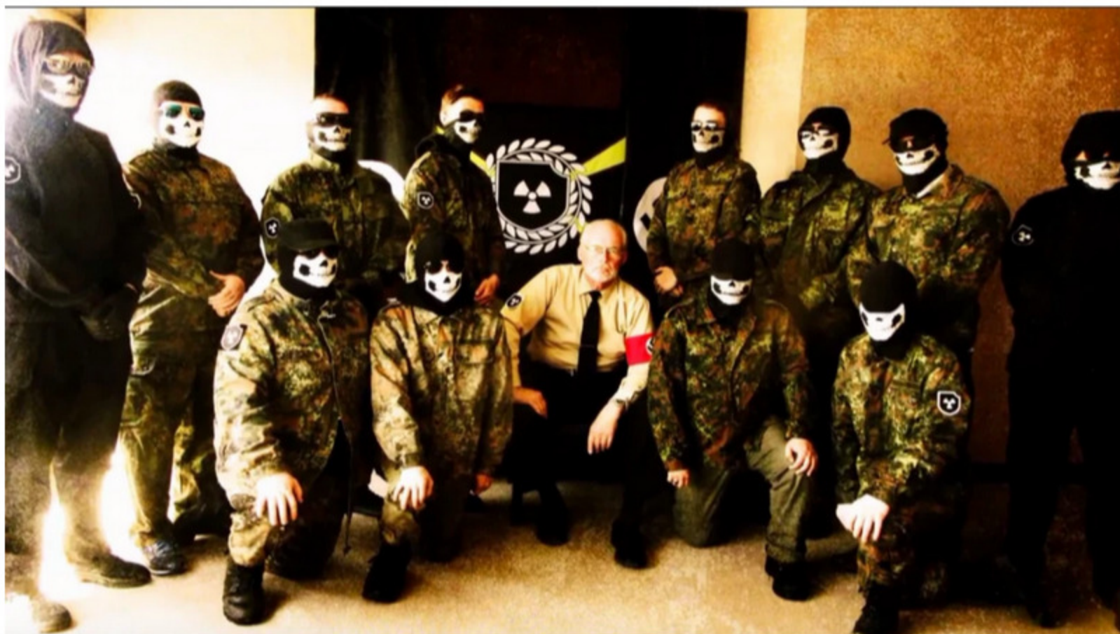
A STILL FROM AN ATOMWAFFEN PROPAGANDA VIDEO.

November 20, 2019, 10:59am Share Tweet Snap