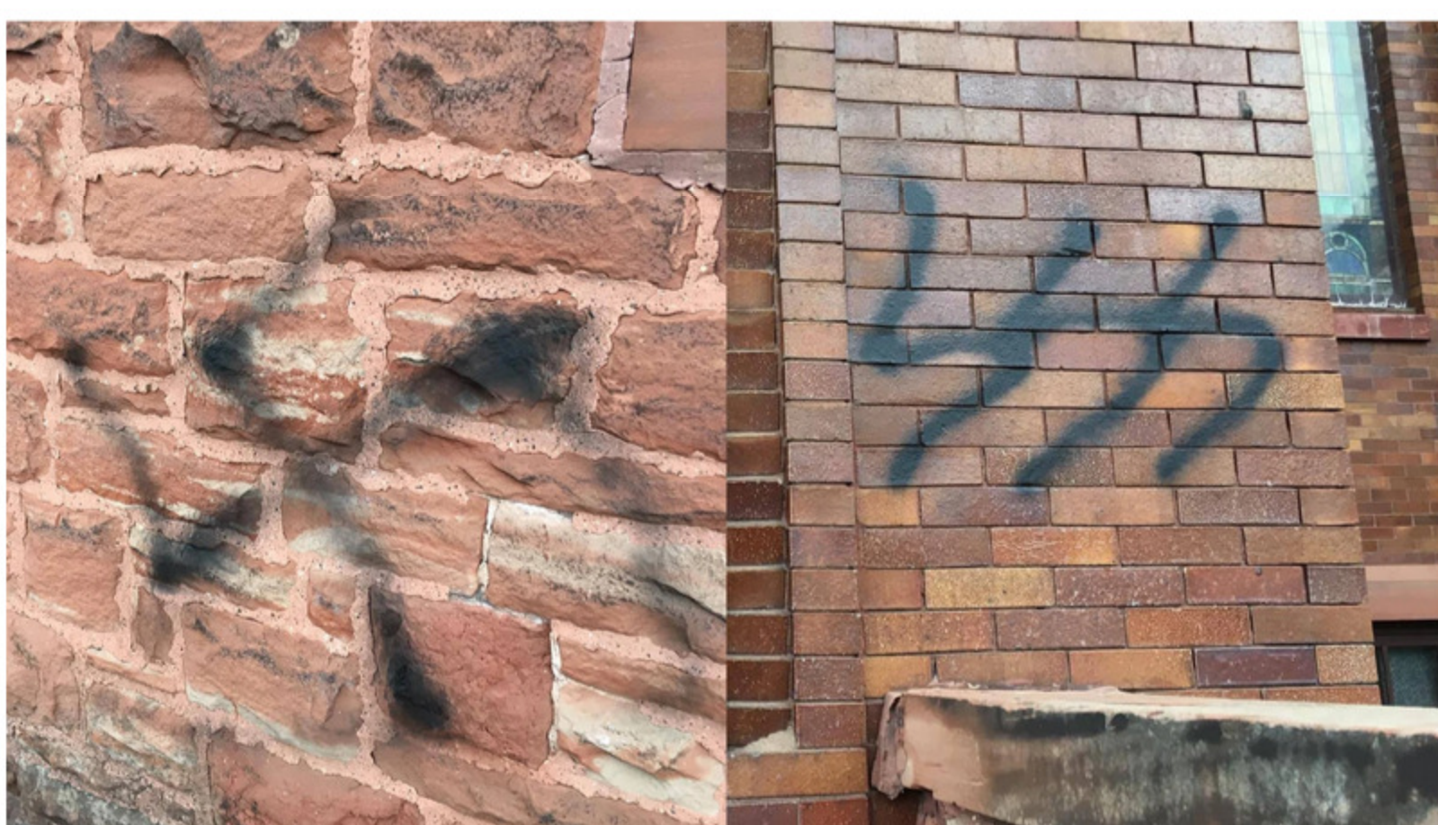
A SWASTIKA AND THREE WOLFSANGELS (THE SYMBOL OF THE BASE) THAT WERE FOUND SPRAY-PAINTED ON A SYNAGOGUE IN HANCOCK, MICHIGAN.